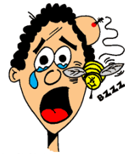
Biological- a bee sting