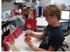
Biological- working with bacteria