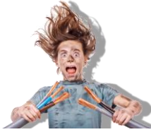
Physical- electric shock