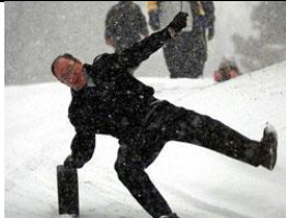
Physical- slipping and falling