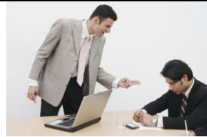
Psychosocial- getting yelled at