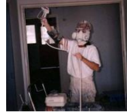
Chemical- paint fumes