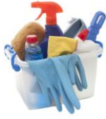
Chemical- Cleaning supplies