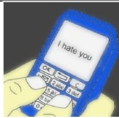
Psychosocial – getting harrassed